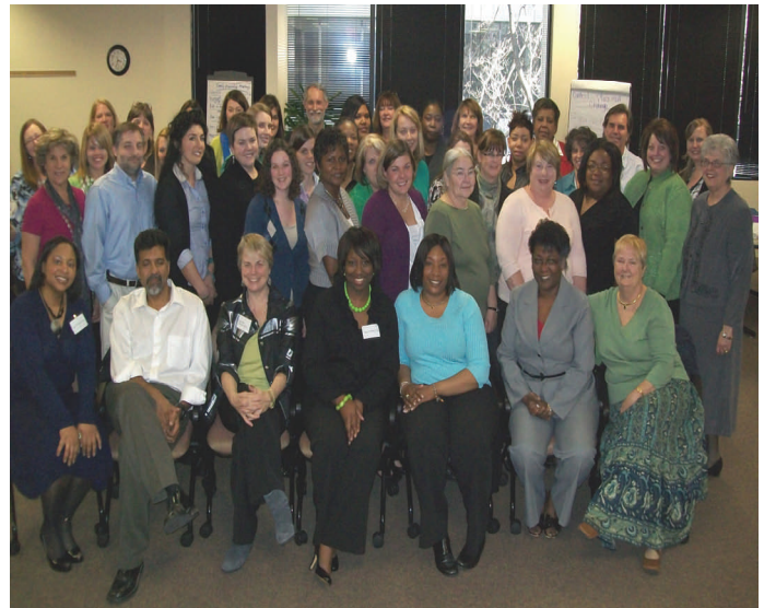
2011 Family Engagement Facilitator Project participants, trainers, and the Family Engagement Unit

In 2010, Virginia began a structured and deliberate approach to partnering with families to improve permanency outcomes for children and youth. In an effort to continue providing support for this initiative, the 2011 Family Engagement Facilitator Project is providing a unique opportunity for 42 family partnership facilitators and state staff. Participants will receive additional training, networking with other facilitators within the state, and skill building techniques to enhance their facilitation.